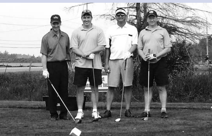
The Codman Foursome