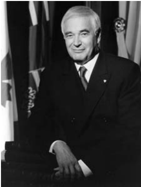
THE LIEUTENANT GOVERNOR OF ONTARIO JAMES K. BARTLEMAN